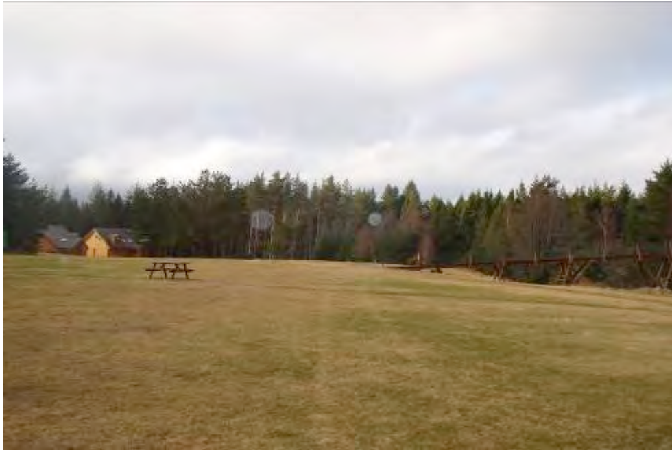
Photograph 1: Site for 4no. proposed wigwams