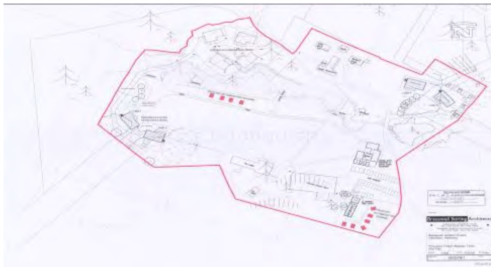
Fig. 2 – Site Plan