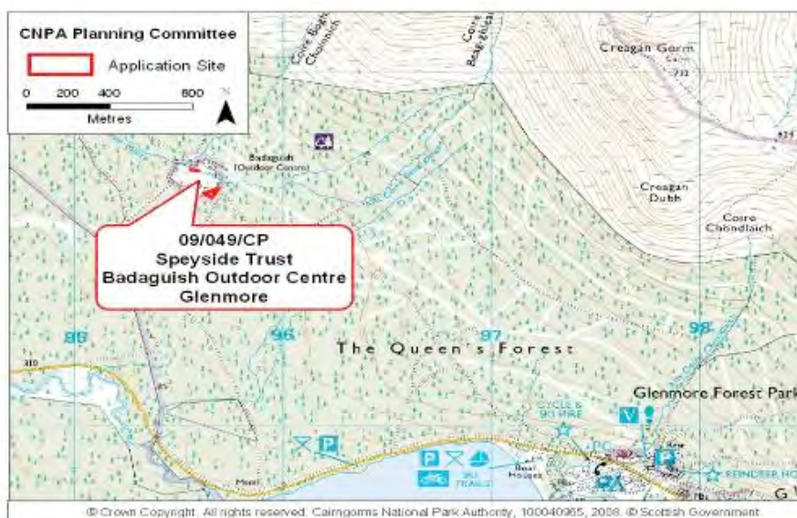
Fig. 1 - Location Plan

RECOMMENDATION: GRANT PLANNING PERMISSION FOR A PERIOD OF 3 YEARS, SUBJECT TO SUSPENSIVE CONDITIONS