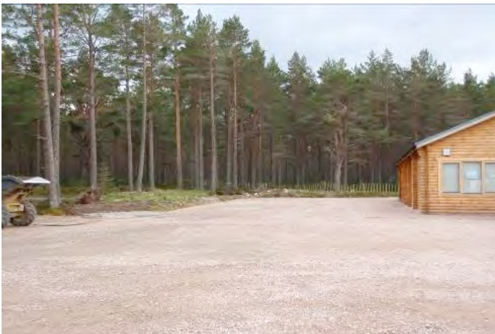
Photograph 2: Site for 6no. proposed wigwams